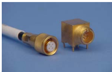
90 Degree Quadrax receptacle contact and transition plug