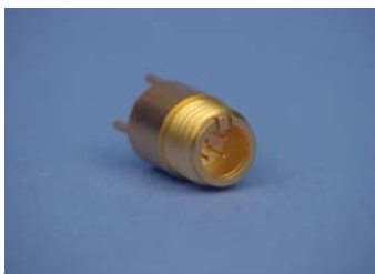
Straight Quadrax Receptacle Contact

Also available are matched impedance Quadrax and Twinax Transition Adapters, which provide a method of launching from the High Speed connectors to the PCB boards. Non-threaded adapters for launching direct from the cable end to the board are also available. Part numbers vary depending on cable. Consult factory for more information.