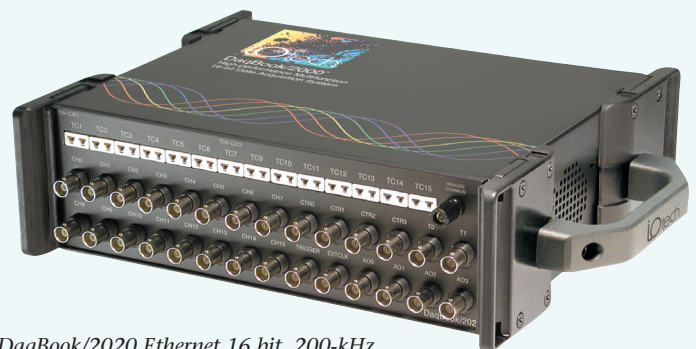
DaqBook/2020 Ethernet 16 bit, 200-kHz data acquisition system with front-panel BNC and TC input channels

DaqBook, DaqView, DBK, eZ-PostView, and Out-of-the-Box are the property of IOtech; all other trademarks and tradenames are the property of their respective holders. 030701_b.