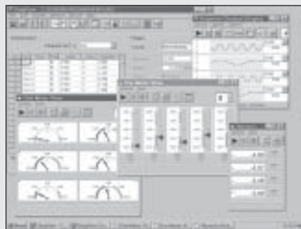
DaqView™ graphical data acquisition and display software is included with all DaqBook systems