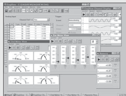
DaqView™ graphical data acquisition and display software is included with all DaqBook systems