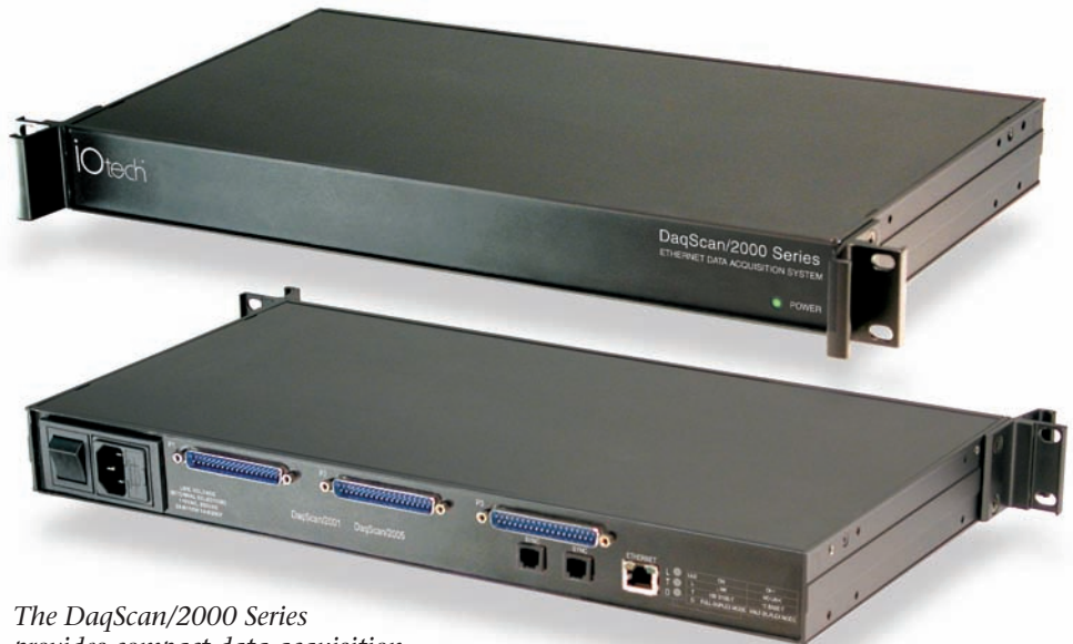
The DaqScan/2000 Series provides compact data acquisition capability for Ethernet-based test systems