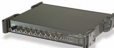
The WBK18 provides a full set of features for making dynamic signal measurements