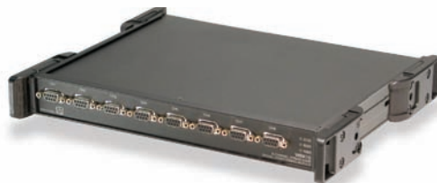
The WBK16 provides eight channels of strain gage input