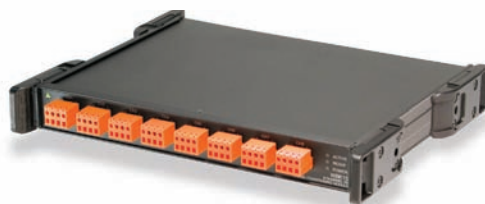
The WBK15 provides up to 8 isolated analog input channels