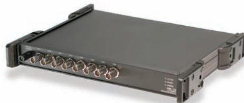
The WBK10A adds eight differential analog inputs